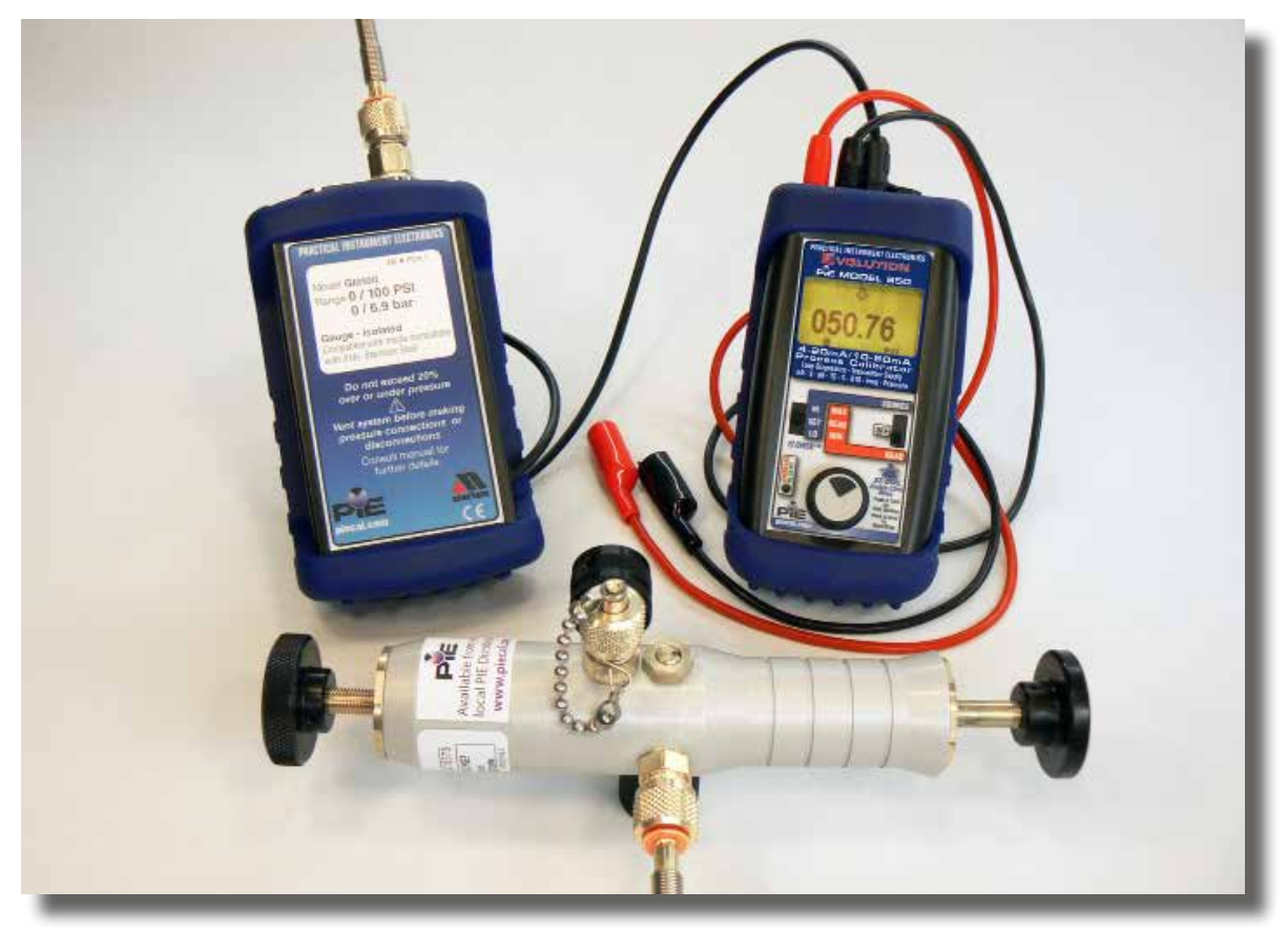
PIE 850 with Pressure Module, Pressure/Vacuum Pump & Hose

PSI • inches, feet, mm, cm and meter of H2O @ 4°C, 20°C & 60°F • inches, meter, cm and mm of Hg @ 0°C; torr • kg/cm2 • kg/m2 • Pa • hPa • kPa • MPa • Bar • mBar • ATM • oz/in2 • lb/ft2