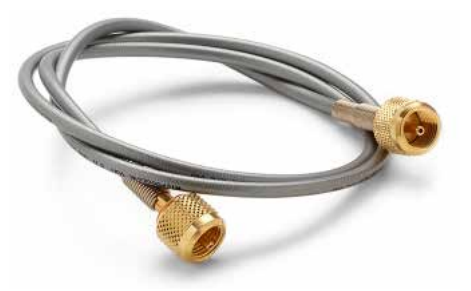
Pressure Fitting Kit Adapts from Quick-test<sup>™</sup> hose to 1/4" male & female NPT, 1/8" male & female NPT and 1/4" tube fitting

Microbore hoses provide a very quick, low volume, high pressure way of connecting any pressure instrumentation to the hand pump and pressure module.