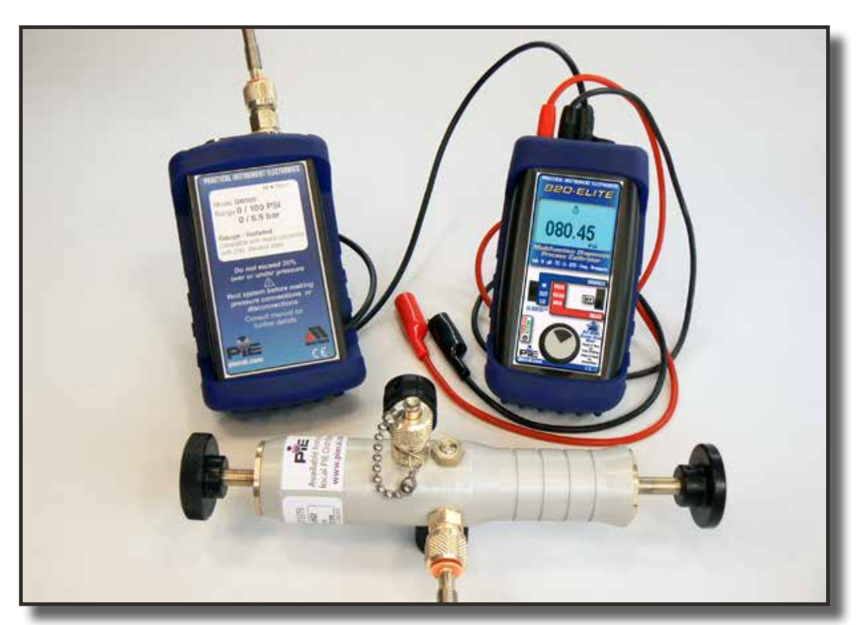
PIE 820-ELITE with Pressure Module, Pressure/Vacuum Pump & Hose

PSI • inches, feet, mm, cm and meter of H2O @ 4°C, 20°C & 60°F • inches, meter, cm and mm of Hg @ 0°C; torr • kg/cm2 • kg/m2 • Pa • hPa • kPa • MPa • Bar • mBar • ATM • oz/in2 • lb/ft2