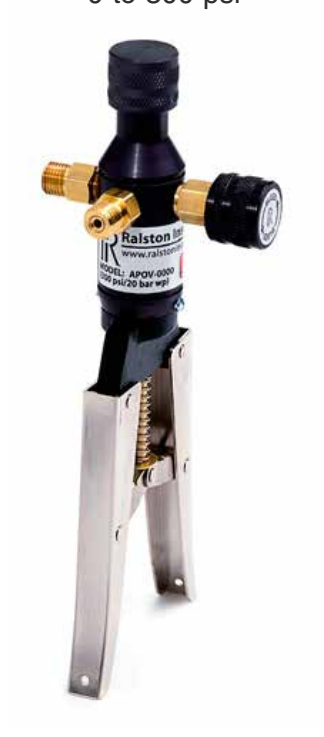
Pneumatic Scissor Hand Pump 0 to 300 psi