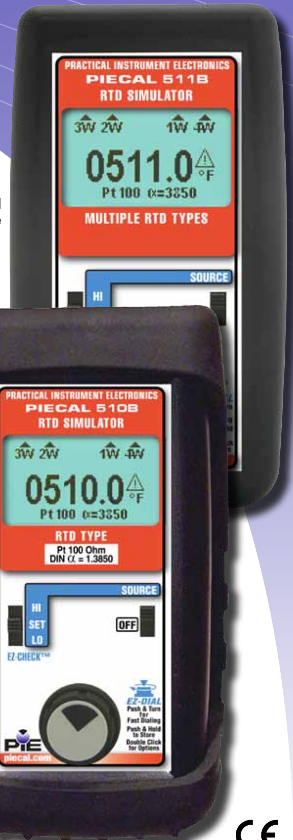
Actual Size (Shown with optional boot)